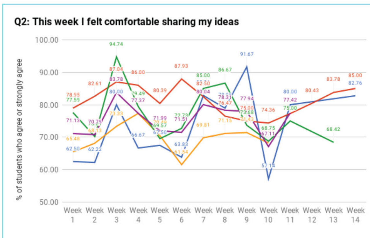
Figure 1. Students' responses to question 2 recorded over 14 weeks. Change in responses to Q2, as shown in Table 1, graphed over the duration of a semester. Each color in the run chart represents data from one teacher.

We quickly discovered that looking at this common data helped us calibrate success on changes to our classrooms aimed at promoting a growth mindset and intrinsic motivation to learn senior-level math, such as the scoreless grading system I was prototyping in my class (Strong & Hollenbeck, 2017). When the students would answer favorably on the survey in a week when I was attempting a particular intervention (like one-on-one check-ins or accountability buddies), I would pass that idea along to other members on our team to test so we could see how it translated into other settings. When an intervention didn't get very favorable responses (like weeks with too much reflection time), the team would discuss that together as well and, more specifically, I was prompted to change the type of feedback I gave my students.